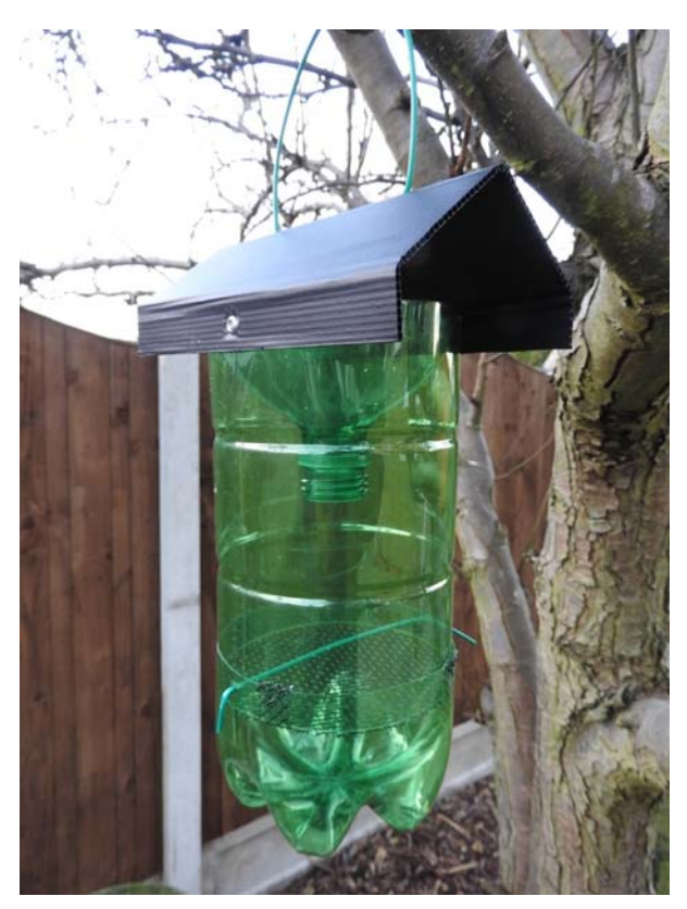
Fig. 9 Completed trap ready to add bait

with a video available on Youtube https://www.youtube.com/watch?v=CR6MUekAjMo